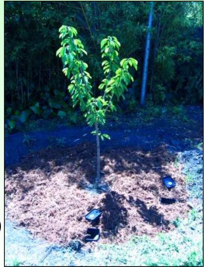
Typical Greywater Irrigation Field